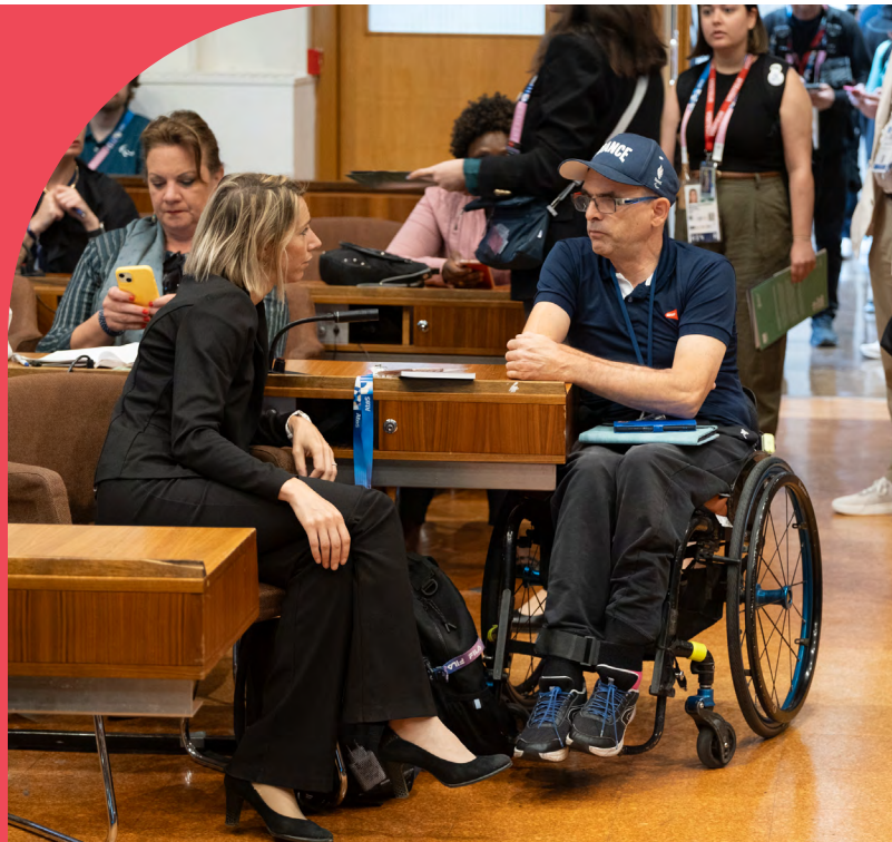
International Disability Inclusion Conference

Two successful biennial international conferences in adapted physical activity are coming together as one under the patronage of UNESCO and organised by the UNESCO Chair, MTU Kerry, Ireland. The pan disability conference covers all areas of disability. Up to 600 delegates are expected from academia, international organisations, government and local government, civil society, and the private sector come together to learn about and share developments relevant to adapted physical activity. Our trade exhibition will be very much part of the ISAPA2025 delegate experience. We will ensure exhibitors can engage with delegates across the week. Up to 60 exhibitors, will showcase innovations, products and services to advance the field of APA.