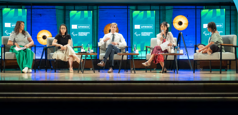
International Disability Inclusion Conference

need France to hear this. Yes, it is okay to be different. Sports and dance and basic of the three really go together, have been fundamentals for us. countless